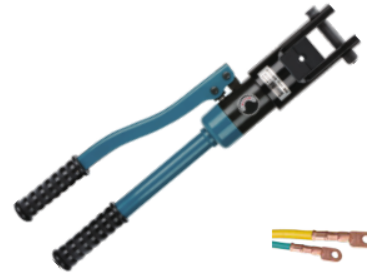
YQK-300 整体式液压钳 Hydraulic crimping tools