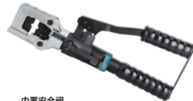
内置安全阀 With safety valve built-in