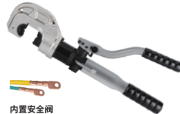
内置安全阀 With safety valve built-in