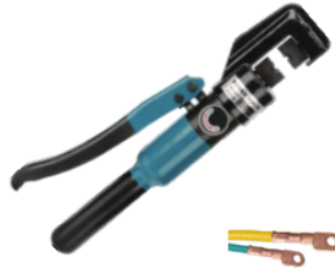
YQK-70 整体式液压钳 Hydraulic crimping tools