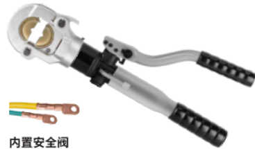
内置安全阀 With safety valve built-in